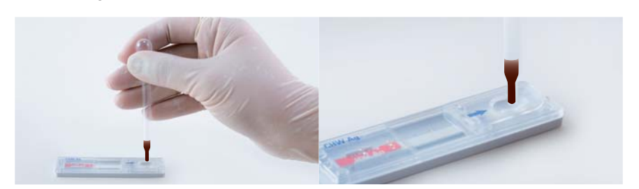
Drop a sample (2 drops) with pipette included.