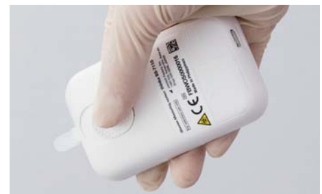
A test strip can be ejected by sliding the test strip disposal lever located on the back of the meter.