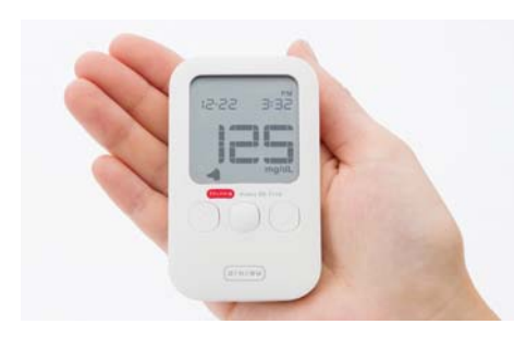
Palm-sized portability enables glucose measurement anywhere.